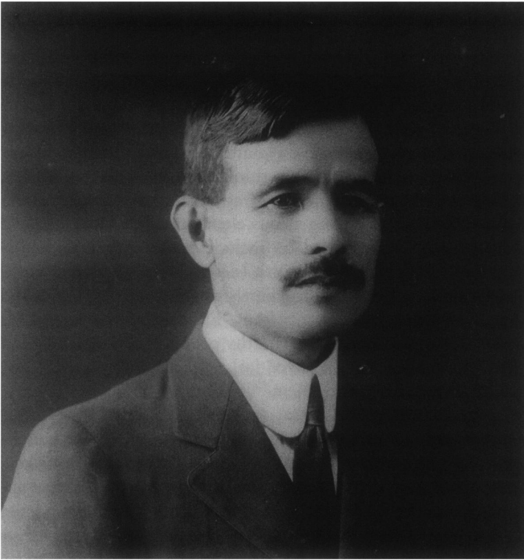
Takao Ozawa (c. 1916). Ozawa emigrated from Japan as a child, attended the University of California at Berkeley, and claimed his right to naturalized citizenship on grounds that he had assimilated, saying "at heart I am a true American." In Ozawa v. United States (1922) and United States v. Thind (1923), the Supreme Court ruled that Japanese, South Asians, and all Asiatics were ineligible to citizenship under federal laws, restricting naturalization to "white persons" and "persons of African nativity and descent."

In 1923, on the heels of Ozawa and Thind , the Court issued four rulings upholding California and Washington state laws proscribing agricultural land ownership by aliens ineligible to citizenship. Those laws had been passed in the 1910s to drive Japanese and other Asians out of farming. In Terrace v. Thompson , the Court held that the alien land laws fell within the states' police powers to protect the public interest. Ironically, Japanese had taken up agriculture during the first decade of the century in the belief that farming would facilitate permanent settlement, civic responsibility, and assimilation. But if Japanese embraced the Jeffersonian ideal, the nativists who dominated Progressive politics on the Pacific Coast concluded that Japan was conspiring to take California away from white people. In a typical statement, United