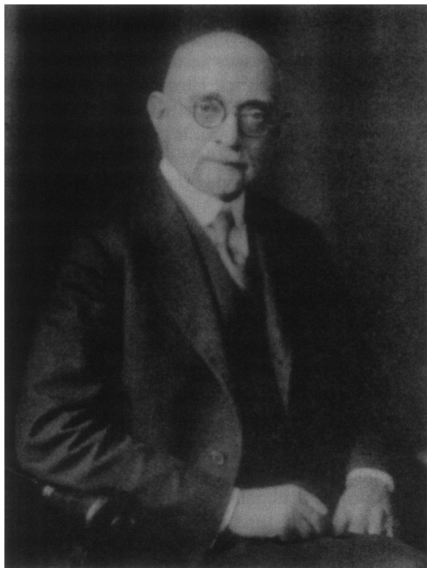
Joseph A. Hill, the chief statistician of the Census Bureau, was chairman of the committee that devised immigration quotas according to the national origins of the American people, as mandated by the Immigration Act of 1924.