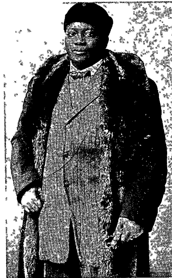
Fig. 1. An elegantly dressed Jack Johnson strikes a manly pose for a photographer in 1911, the year after he won the world heavyweight championship.

Johnson was equally insistent upon his masculine right to wield a man's power and authority. He treated minor brushes with the law—his many speeding tickets and automobile violations—contemptuously, as mere inconveniences which he was man enough to ignore. 32 In his autobiography,