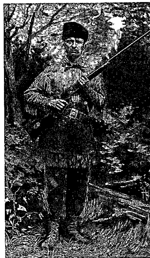
Fig. 12. Theodore Roosevelt constructs himself as a virile Western ranchman in this frontispiece from Hunting Trips of a Ranchman (1885).

TR’s efforts to transform his Jane-Dandy political image succeeded brilliantly. In 1886, when he ran for mayor of New York as the “Cowboy of the Dakotas,” even the Democratic New York Sun lauded his zest for fighting and