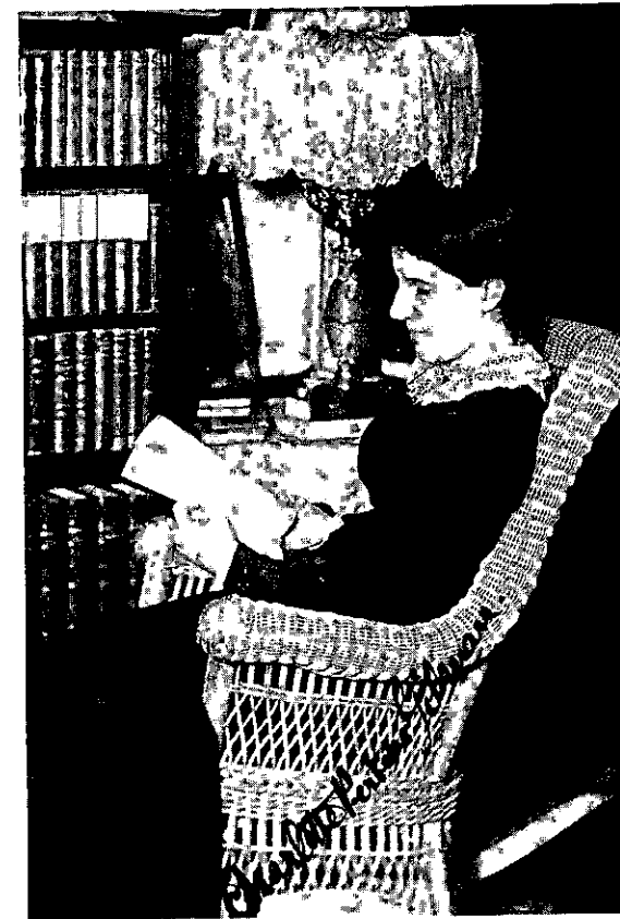
Fig. 10. This publicity photograph represents the civilized womanliness Charlotte Perkins Gilman worked so hard to construct for herself and her work. Gilman sits reading in a rocker. The atmosphere is homelike, with a Victorian lamp and furnishings. Yet this womanly domesticity is mingled with the “human” achievements of advanced civilization—the framed artwork on the table, and especially the shelves of thick, leatherbound books.

How could a woman so productive believe she was a neurasthenic in-