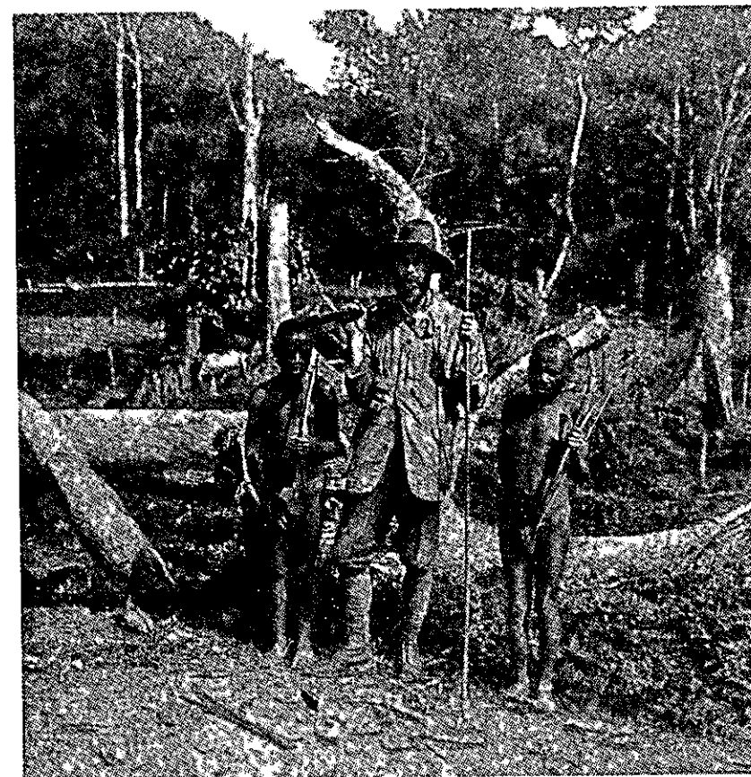
Fig. 2. A manly European explorer is implicitly contrasted with "inferior" African pygmies in this illustration from a 1908 issue of the National Geographic .

Although linking manhood to whiteness was no novelty, by the 1880s middle-class white Americans were discovering an extraordinary variety of ways to link male power to race. Sometimes they linked manly power with