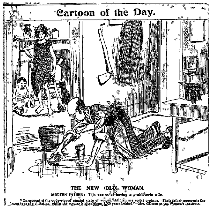
Fig. 11. Cartoon from the London Morning Leader, March 2, 1905, illustrating Gilman's views (presented in a lecture during one of her many tours) that by forcing women to remain in the home, society made women "savages" compared to active, "civilized" men.

agonies she had suffered as a young woman, when she had been forced to choose between her race and her sex. When Dr. Mitchell had tried to confine her to the nursery and to exile her from civilization, Gilman had nearly lost her sanity. Women and Economics proved that she had suffered needlessly. Her physician and her society had posed a false dualism: there was no need for her to choose between her womanhood and her race. Women like herself were central to civilization—to its original development, to its past history, and above all, to its future advancement. As Anglo-Saxons, they had every right and every duty to contribute their all to civilization's future by taking part in what had erroneously been called "the male sphere." This was their racial duty, a duty they dared not shirk. For if white women remained domestic "squaws," in a state of savagery, civilization itself was doomed. It was their duty, both as members of their sex and as members of their race, to take up the struggle to advance civilization.